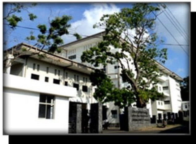
Court Complex Tangalle