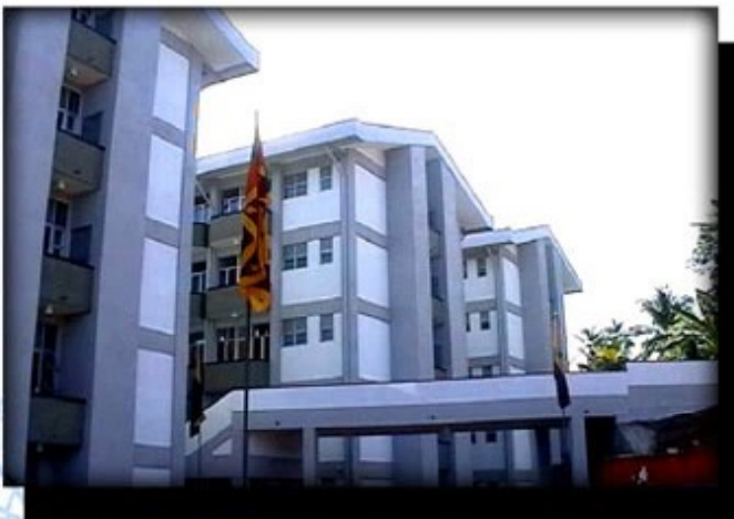
Karapitiya Base Hospital