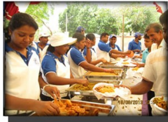
Annual Dansala at Katharagama