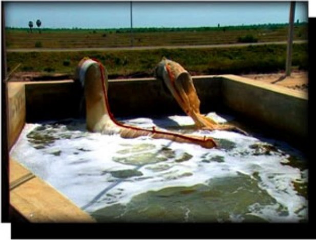
Shrimp Farm Vakare

The Company's substantial growth in the water supply sector, was established by VVK being recognized as one of the best contractors in the said sector by National Water Supply & Drainage Board.