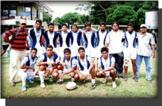
Sponsorships for Sportsman