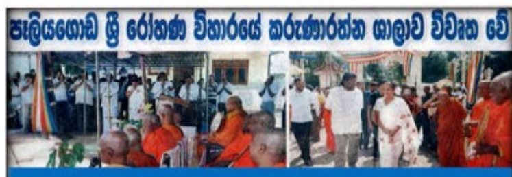
Building for Rohana Viharaya