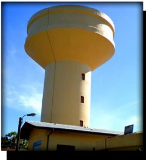
Kalawanchikudi Water Tower