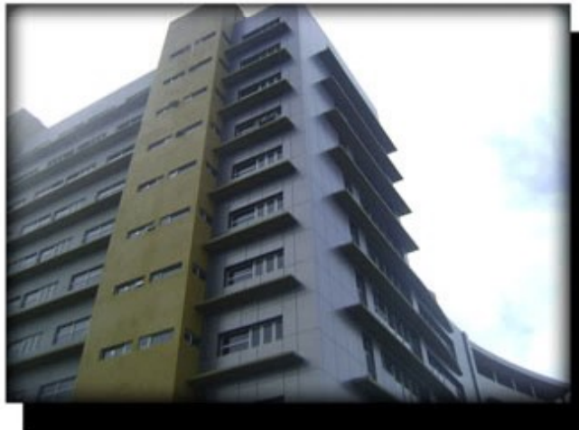
Census & Statistics Battaramulla