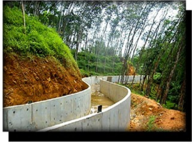
Denawaka Ganga Mini Hydro Project