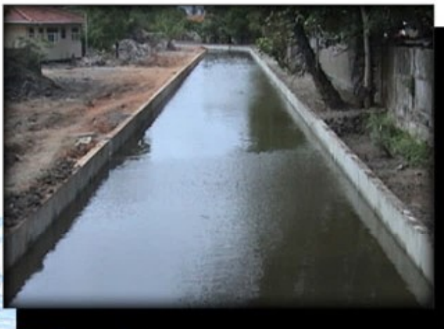
Storm Water Drainage Improvement in Puttalama Urban Council area.