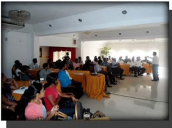
Positive Participation at Training