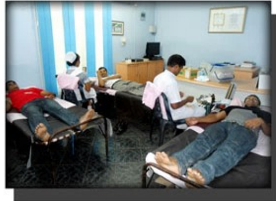
Annual blood donation campaign